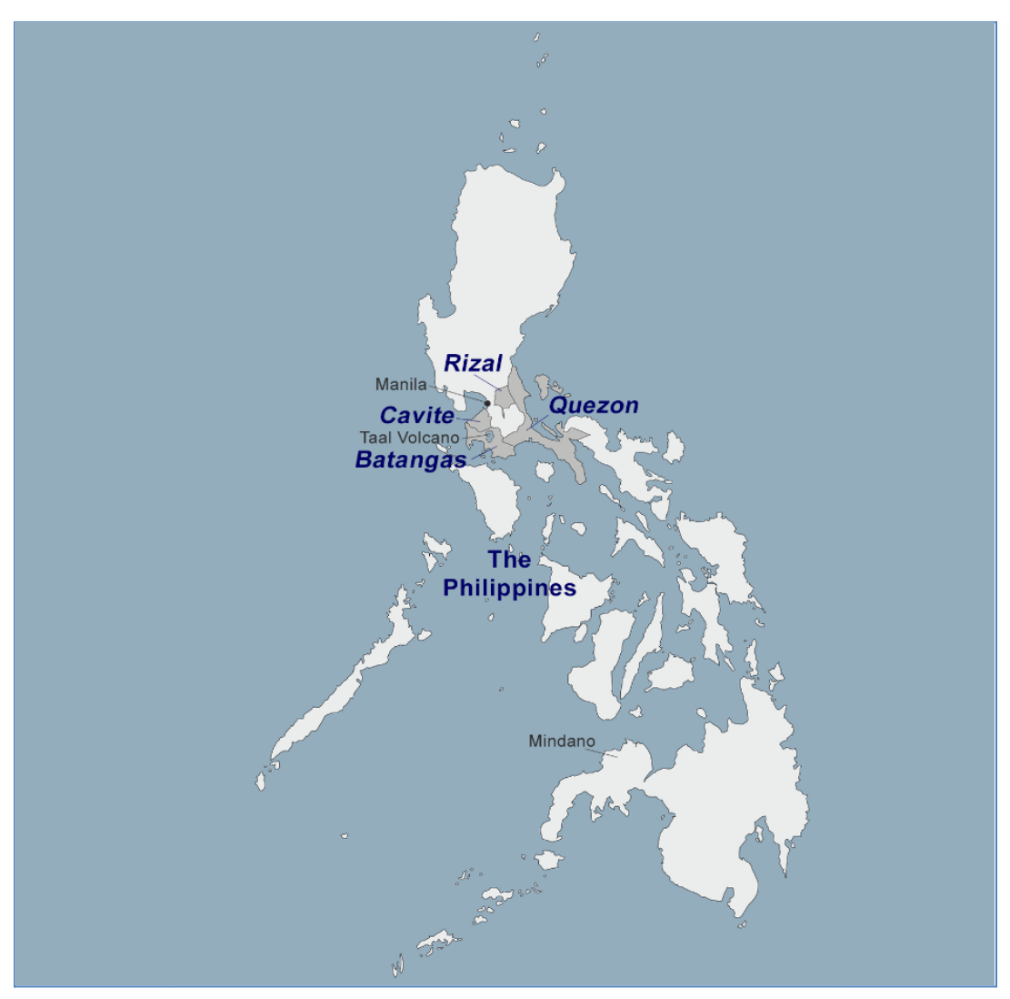
Figure 4: Map of the Philippines and relevant sites

dynamics at play in the Philippines during the Taal and COVID-10 responses are emblematic of response contexts likely to feature prominently in the landscape of humanitarian-military relations for years to come.