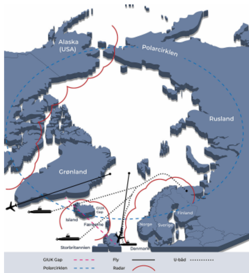
Figure 1. Overview of current radar coverage for air monitoring in the Arctic. xxi

Greenland's airspace. Greenland is an unsupervised territory where incoming aircraft and cruise missiles heading towards the North American continent can approach undetected (see Figure 1). xx Further, Russian Northern Fleet underwater activities in the Danish Strait (so-named, but neither Danish nor a strait, per se) are virtually undetectable as the Danish armed forces have very limited anti-submarine warfare (ASW) capabilities. The Danish armed forces do have maritime surveillance capabilities, but these are insufficient to provide continuous comprehensive coverage of Greenlandic waters, making maritime domain awareness a significant challenge for Greenland.