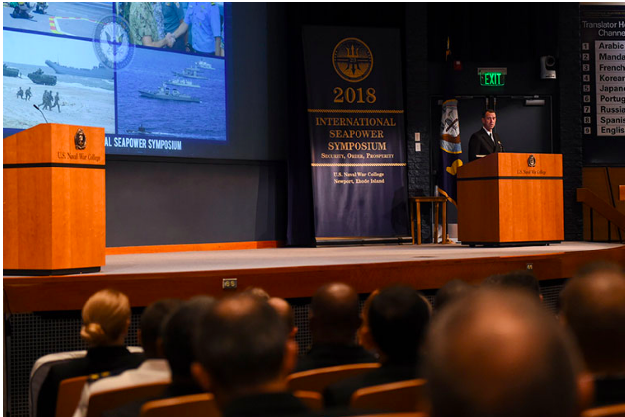
Figure 4. 24 th International Seapower Symposium, Newport, Rhode Island

The United States Government, working through the Navy Staff and the Naval War College, should invite the Russian Federation Navy and Coast Guard to the bi-annual U.S. Naval War College International Seapower Symposium (ISS). Held every two years since the inaugural event in 1969, this constitutes the largest and most influential maritime leadership forum in the world. This forum invites heads of navies and coast guards from around the world to collaborate on collective maritime security issues. Topics range from humanitarian assistance, search and rescue, domain awareness, law enforcement, and joint/multilateral operations – all aiming to enhance a common understanding of maritime security worldwide. With the global ramifications of a warming Arctic and rising Arctic maritime activity, maritime security in the Arctic region will likely become a consistent pillar of ISS in the future.