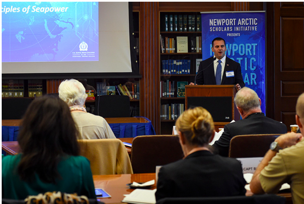
Figure 5. Newport Arctic Scholars Initiative 2019

NASI events rotate between North America and Europe, reflecting the importance of diverse perspectives. Indeed, the events thus far have greatly added to regional discussions. NASI has focused on Arctic security awareness, capabilities, confidence-building measures, and the development of a future collective Arctic security framework. As climate change continues to evolve the region and Arctic military activity continues to rise, security of the Arctic region will likely become a consistent theme in international policy formulation. NASI aims to be the leading contributor to Arctic security organization and development in the future.