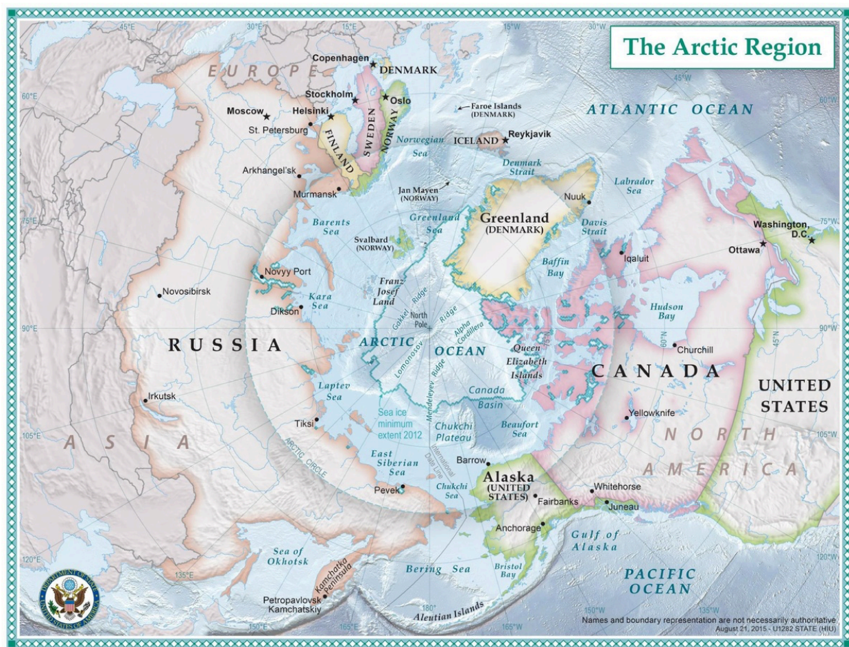
Figure 1. Political Map of the Arctic Region

As fears of a new cold war brew, however, the guarantors of that international order such as the Arctic Council and Arctic Coast Guard Forum, to name a few, may be not be sufficient to ensure security and dialogue in the region.