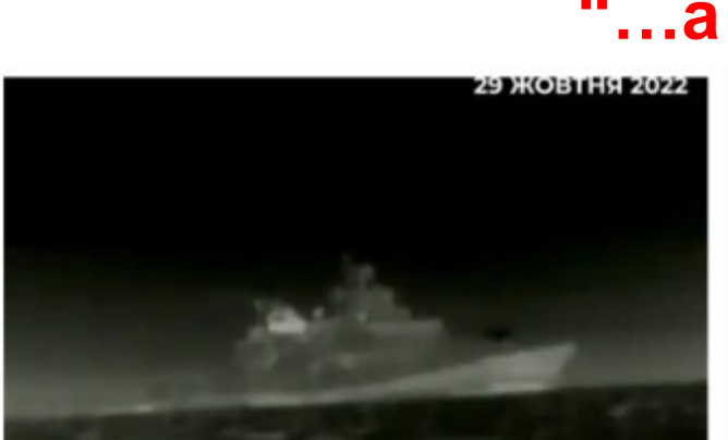
Minutes before the USV attacks to Admiral Grigorovich-class frigate (Screenshot from the footage circulating on

...a cross between a canoe and a jetski..."