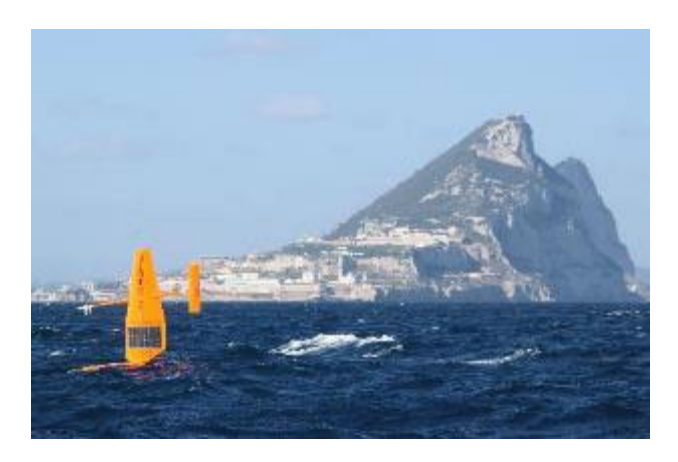
Freedom of Navigation (as per UNCLOS)