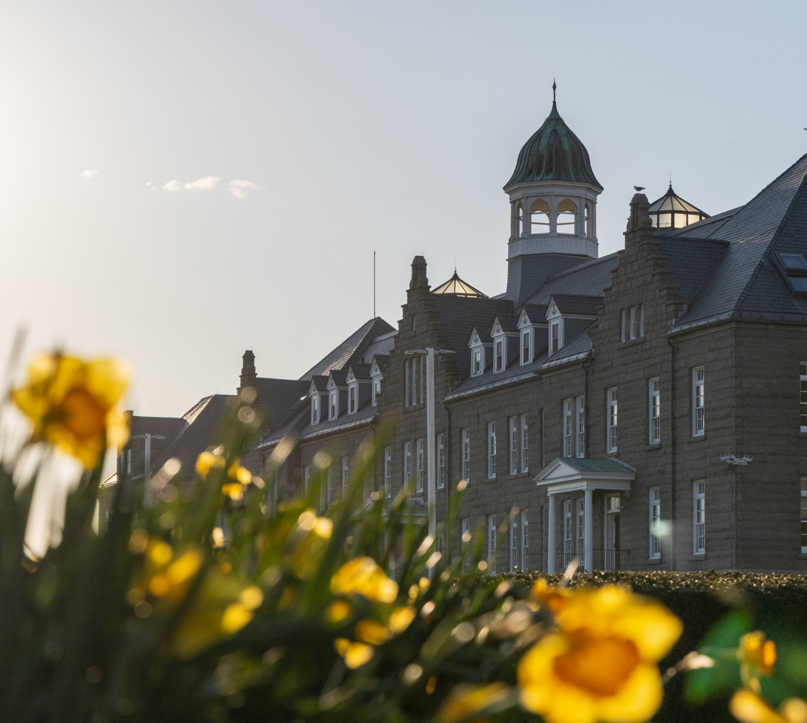
Cover photo/2024 CIWAG Maritime Symposium main photo: The Nimitz-class aircraft carrier USS Abraham Lincoln (CVN 72) transits the Suez Canal. (U.S. Navy photo by Mass Communication Specialist Seaman Dan Snow/Released) 190509-N-ME568-1420 | Inside cover photo: Luce Hall, U.S. Naval War College (Spring 2024)